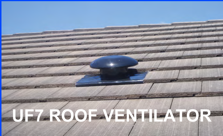
UF7 ROOF VENTILATOR