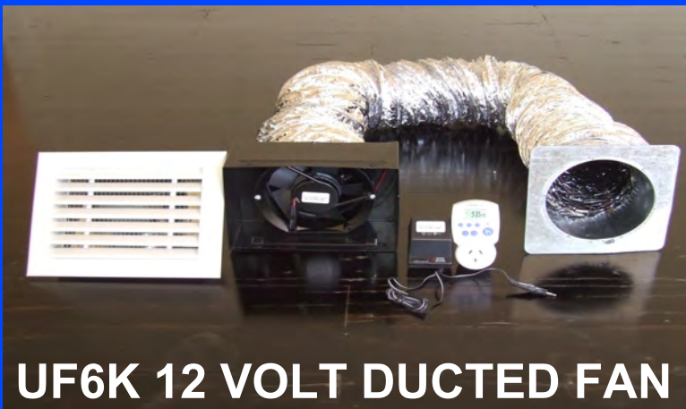
UF6K 12 VOLT DUCTED FAN