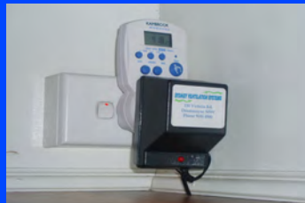
Timer / Transformer