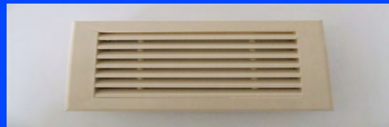
UF4PV Passive Vent